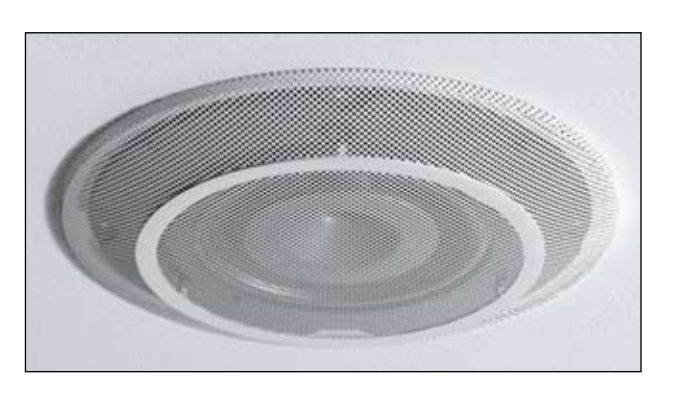
Also available in black and custom colors (backbox not included)